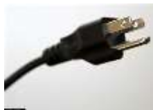
regular electrical plug

If yes please circle your electrical requirements and quantity of each: